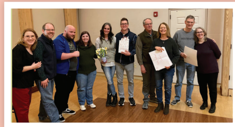
The Fellowship Hall Community had a great time celebrating Valentine's Day together. Thank you to all who came.