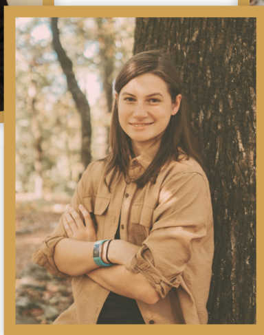
Ellis Alley Evangel Christian School